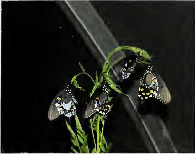
Figure 5. An aggregation of four B. philenor in the enclosure taken in the evening.

selection and aggregations. Other butterfly species (e.g. Danaus plexippus ) choose their perching location based on temperature and protection from wind and precipitation (Brower et al. , 2008; Salcedo, 2010). In B. philenor , perching high in trees may allow the butterflies to start basking earlier and therefore leave their perch, where they are most susceptible to predation (Rawlins & Lederhouse, 1978; Lederhouse et al. , 1987), earlier. An indication that B. philenor individuals are seeking specific conditions for perching is found in their evening activity. In the field and enclosure, we regularly observed interactions between perched and patrolling individuals in the trees during the evening. Individuals often settle on several perches before selecting their overnight perch. In the enclosure, most individuals landed on at least one perch before settling on a perch overnight. In the mornings, there is less interaction, but the butterflies still land on several perches before becoming fully active.